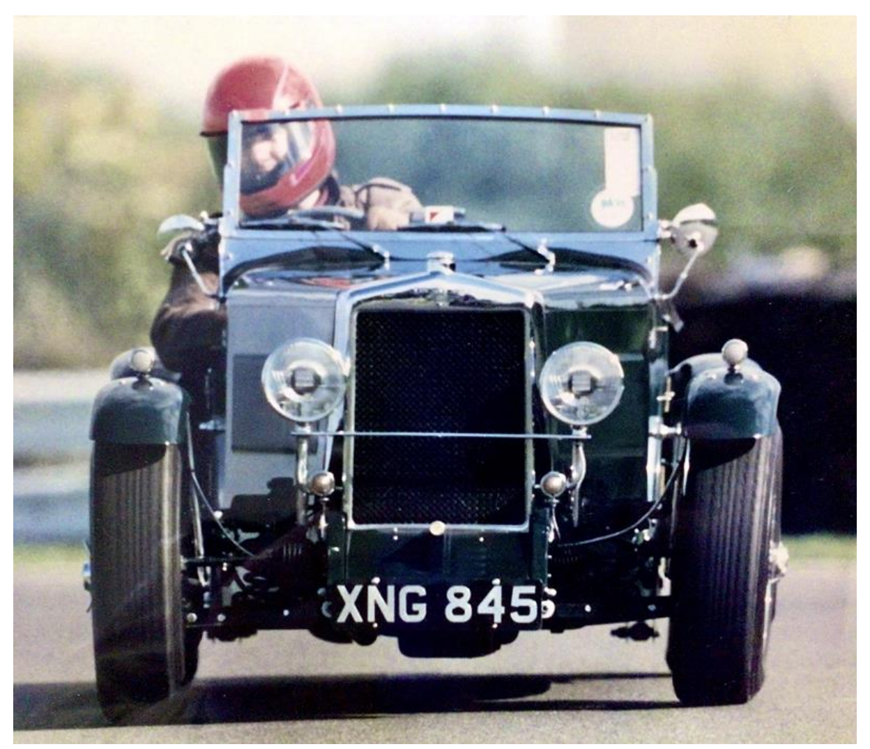
Castle Coombe Kit Car Action Day 1994 - TA cornering at speed.

Okay you have got your NG built, it looks great and your wife or partner are still talking to you. Life is great!