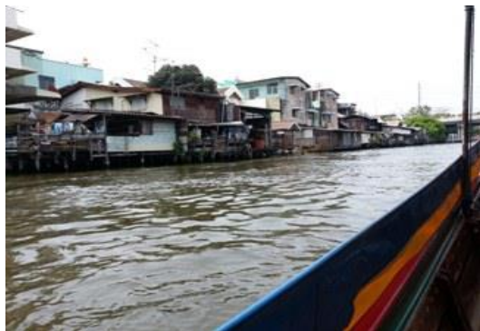
In the canals of Bangkok

We had the entire 'long boat' to ourselves, one of those with a massive diesel engine mounted high up at the back with a long drive to the prop in the water. We were whisked off at speed in the main river and into the canals until we were stopped by the river traders, "would like to buy a carved elephant, Buddha or buy a beer for the driver", we passed on them, and oh we were given life jackets; no clips to buckle up! However it wouldn't from drowning it would be the poisons in the polluted river.