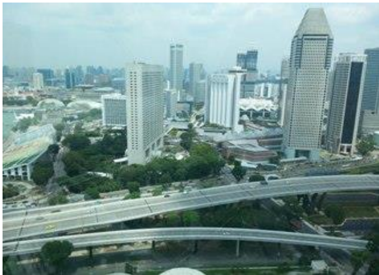
Our hotel left in front