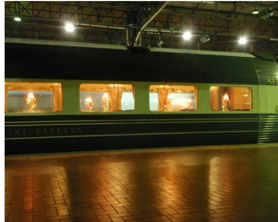
Kuala Lumpur station

Only two passenger trains travel on this Malaysia line, one is us (E&O) the rest is freight!