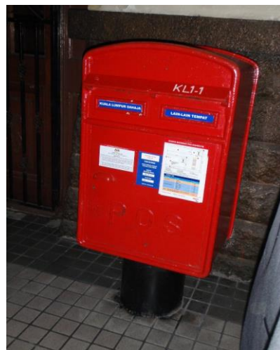
Original V&A post box with new door