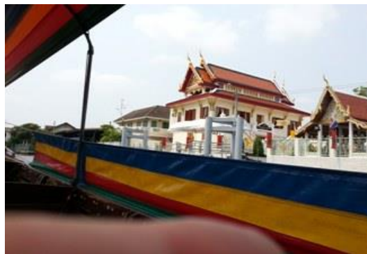
The Temples for worship every 100m