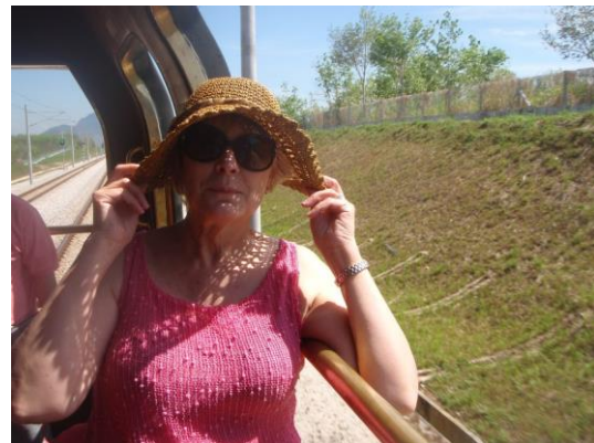
hold on hat, and don't lean out of the window

We had a stop in the afternoon on the third day at Butterworth station then a coach trip over the 8km bridge to the island of Penang where we spent an hour or two in George Town, I heard a familiar sound of Big Ben yes it was mini one with the same chimes, given to George Town by Victoria and Albert, those Beckhams get everywhere! Then a few more Temples and walked around the town. We elected to return on a ferry after a few drinkies in the Eastern and Oriental Hotel as you do.