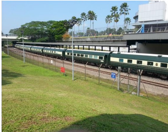
Woodlands Station Singapore, 22 carriages