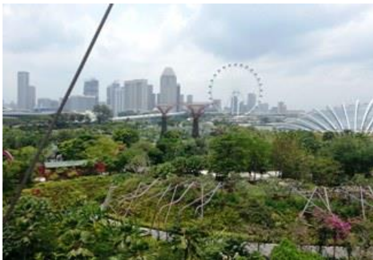
Yep they have one too