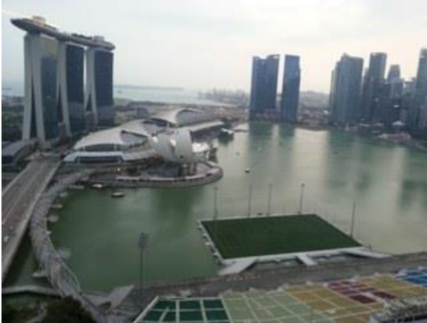
view from the top

As Allen and Jill had an upgrade room (same as ours) it gave them free use of the restaurant on the top floor and; could invite a guess or two, that evening we all dined together and obviously I drunk too much wine. Next morning we had a 6am early call to catch the flight home, I didn't want any breakfast!!